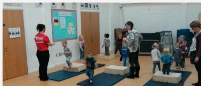
Promoting a love of sport starts in nursery!

It has been a packed schedule of football matches this week for the boys' squad. They have had three fantastic matches: a 7-1 win against St John's, a 2-1 loss against Westfield and a 5-0 win against St Nicholas. Well done to all the boys involved. Many thanks to the parents for transporting and supporting. Please can we have all kit back in on the first Monday after Easter.